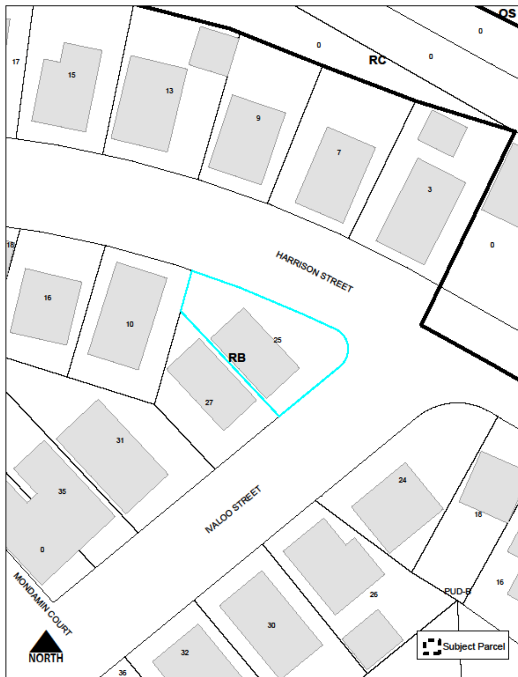
25 Ivaloo Street

(b) In accordance with the Findings on Historical and Architectural Significance , which addresses period, style, method of building construction, and association with a reputed architect or builder, either by itself or in the context of a group of buildings or structures, as well as integrity, the ability to convey significance, Staff recommend that the Historic Preservation Commission find 25 Ivaloo Street historically or architecturally significant.