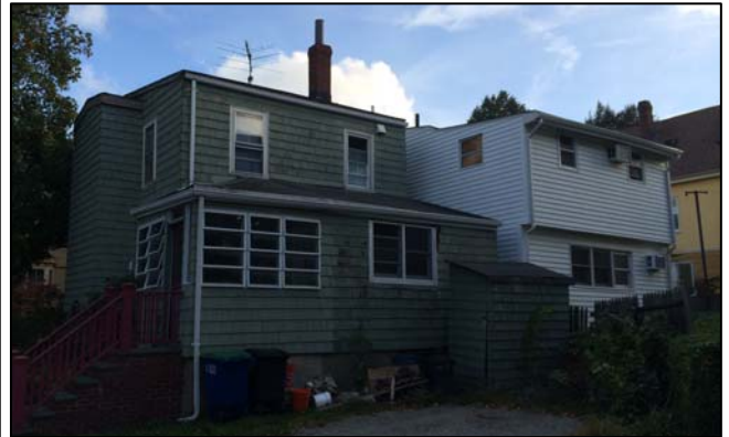
Bottom: 25 & 27 Ivaloo, rear additions